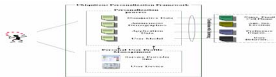
Fig. 1 Personalization Framework in Ubiquitous Environment

The personalization process consists of transforming a general incoming flow into a personalized outgoing flow. The flow data may consist of put together of actions, static information, and real-time stream. In order to perform its task, the personalization process would have a description of the flow data, which will allow it to understand the semantic of the information. This information can either be computed from the data for instance the e-commerce and m-commerce can be obtained from its user query keywords, or be expressed data as shown by a user profile. We call this information metadata in semantic web.[11] As metadata in semantic web, the personalization process relies on the user profile module, which manages information such as: i) name, email, cell-phone number and so on as nominative data. ii) age, sex, location, language etc as anonymous demographics by user profile. iii) preferences degree, applications' configurations, persistent state as application data. iv) user behavior. We shown as follow in Fig. 1